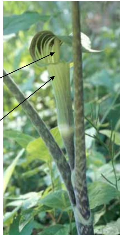
Jack In The Pulpit